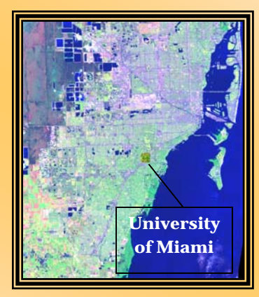
Landsat Image of Miami and Vicinity

On campus, opportunities to become involved in organizations, including the Graduate Student Association, intramural sports, and academic honor societies such as Gamma Theta Upsilon (GTU) abound.