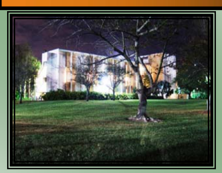
Antonio Ferré Building – Home of the Department of Geography and Regional Studies

The Department's GIS Laboratory is home to fourteen Pentium workstations. and maintains licenses for Erdas Imagine, ArcGIS. ArcView and related extensions. Idrisi. Cartalinx. SPSS. SAS.