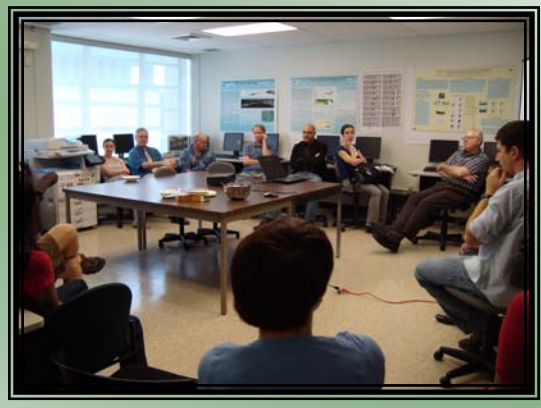
Department's GIS lab

vanced Remote Sensing (CSTARS), which collects and maintains extensive archives of SPOT, Radarsat, and other earth satellite imagery. Opportunities exist to collaborate with faculty and students at CSTARS and throughout the University community, including the Rosenstiel School for Marine and Atmospheric Sciences, and the UM Medical School, both internationally recognized centers of academic excellence.