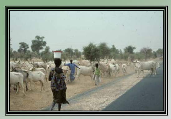
Cattle herders in the West African Sahel

2003, the Department added three new faculty members to expand its emphases in environmental geography, remote sensing and Geographic Information Systems (GIS). Regional faculty expertise includes Africa, the Caribbean, Latin America, the Middle East, North America, South Asia, Southeast Asia, and Western Europe.